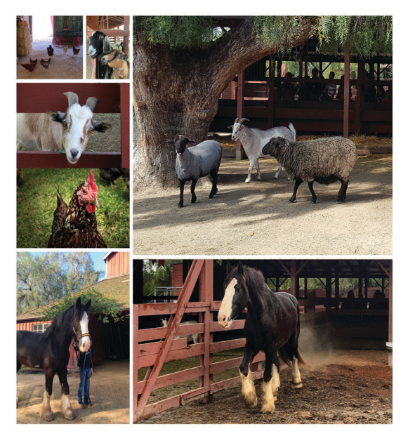
Open Wednesday - Sunday, 1 pm - 5 pm Free admission. Enter through Bixby Hill residential security gate at Anaheim and Palo Verde